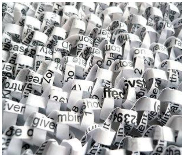
A detail of “possible side effects may include (zoloft)” (2010), by Stefana McClure.

During a 2004 art residency in London, he said, “one of the things that kept coming up” was the amount of garbage generated by the United States. After the hurricane, Mr. Blackwell — not an environmental artist, but with his sensibilities heightened by what he had seen in New Orleans — decided to use that symbol of trash, the empty plastic bag, and turn it into something else. The result is a series of bags sewn and embroidered with so many layers of silk, wool and yarn that they have been transformed into objects of beauty.